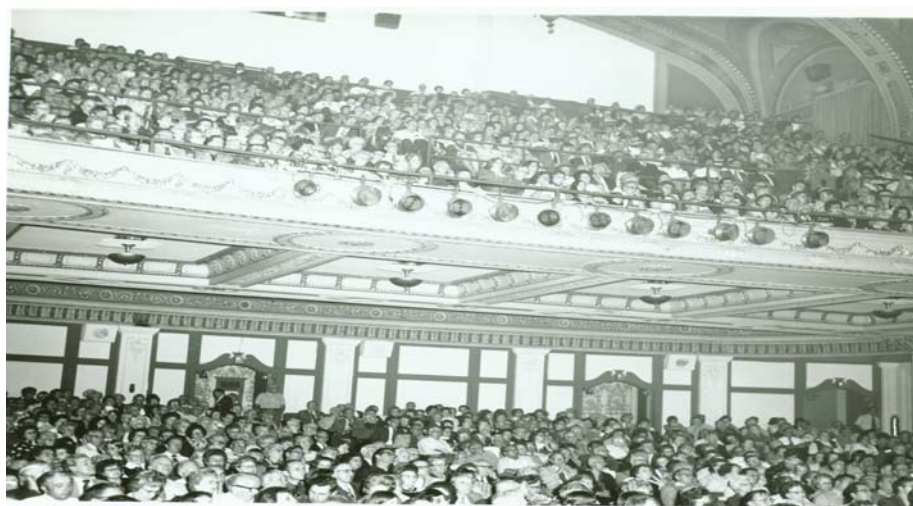
Fig. 11 The capacity crowd for the Beacon Theatre Showing of Queen Kelly .

It is gratifying to know that the house was sold out, and this experience should certainly be significant to exhibitors who are having a hard time selling enough seats to keep such magnificent show places out of the red. 80