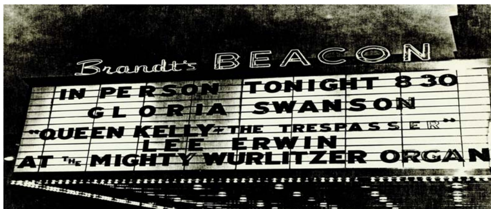
Fig. 10 Marquee for the 1967 showing of Queen Kelly.

The performance was a triumph. The Beacon Theatre was filled to capacity (see fig. 9) In a letter to Erwin, E. J. Quinby provides a glimpse of the successful evening.