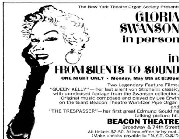
Fig. 9 A flyer which advertised the 1967 Concert at the Beacon Theatre.

After Queen Kelly , Miss Swanson will relive for you, for the first time anywhere, her trials and triumphs in maintaining her stardom while she closed the era of the silents and climbed to greater heights in the new worlds of talking pictures. 78