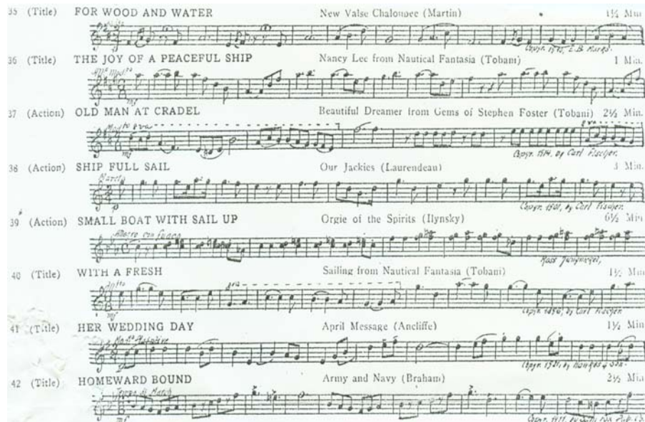
Fig. 3 A cue sheet from the silent film era

sheets, published and circulated with each film, included a breakdown of the dramatic structure of the film, with musical suggestions for each scene. (See Fig. 3)