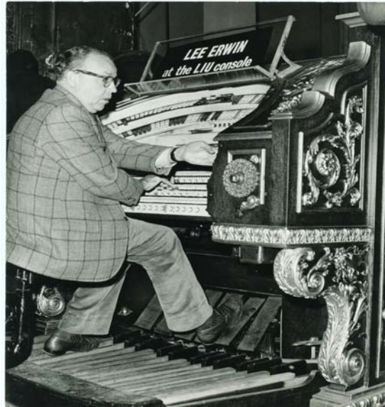
Fig. 14 Lee Erwin in concert

Not only did Erwin's career keep him busy composing music for television and movies, but it soon brought him into the limelight. The Lee Erwin Collection contains two videocassette recordings of television programs that document Erwin's unique musical career. The CBS Morning Show interviewed and filmed his performance at the Alabama Theatre in 1985. Vermont Public Television also produced a 1987 documentary about Erwin. But it was not until the 1987 Woody Allen movie Radio Days that Erwin found himself on the silver screen. In this nostalgic film set in the 1940s, Erwin convincingly portrays a roller rink organist. 92