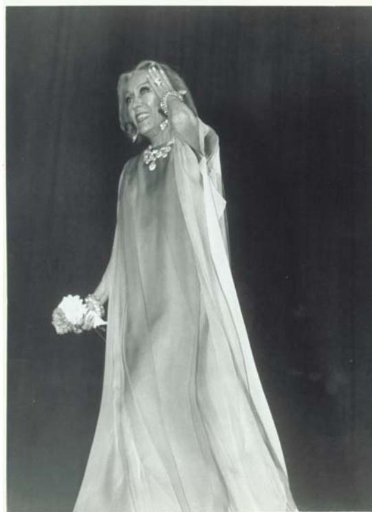
Fig. 12 Gloria Swanson at the Beacon Theatre 8 May 1967

The success of the 8 May 1967 performance at the Beacon Theatre prompted the New York Theatre Organ Society to commission Erwin for another film score. Thus in 1968 he composed the music to one of his most frequently performed film presentations, Valetino's film The Eagle . It premiered 1 May 1968 in North Tonawanda, New York at