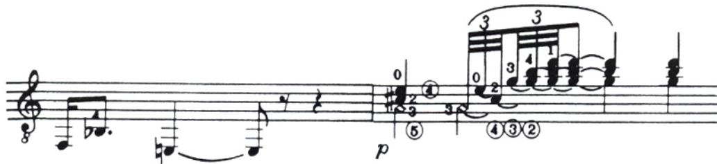
Example 25: Tippett, The Blue Guitar, “ Dreaming, ” m. 16 and m. 17

The “ rhetorical recitative ” is followed by its repetition (mm. 13-16) a minor third above and closes with a cadence on E, which serves as the dominant note of the repeated opening theme, this time in A.