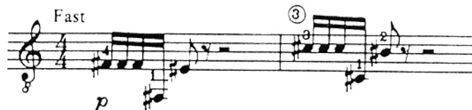
Example 16: Tippett, The Blue Guitar , “ Juggling ,” m. 1 and m. 2

In the fifth and sixth measures the motive expands from seven to eight notes, always beginning on F-sharp. The odd-number grouping creates a poly-rhythmic feel, which increases the intensity and forward motion of the phrase until its cadence on a chord built on perfect fourths.