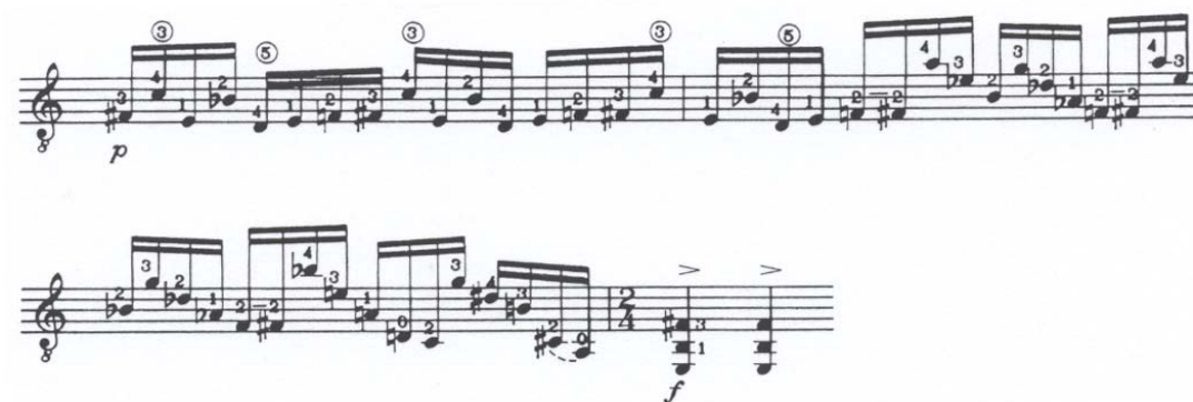
Example 17: Tippett, The Blue Guitar , “ Juggling ,” mm. 5-8

In the fifth and sixth measures the motive expands from seven to eight notes, always beginning on F-sharp. The odd-number grouping creates a poly-rhythmic feel, which increases the intensity and forward motion of the phrase until its cadence on a chord built on perfect fourths.