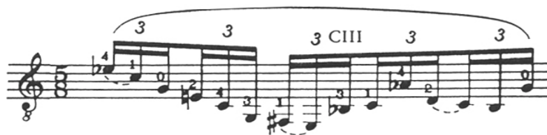
Example 4: Tippett, The Blue Guitar , “ Transforming ,” m. 31

At m. 31, a triplet figure is presented, which produces an underlying rhythmic acceleration. The first six notes are C triads in second inversion with alternating thirds, E-flat and E-natural. The use of both the major and minor tonalities is perhaps another reference to the conflict between light and dark , this time portrayed with tonality.