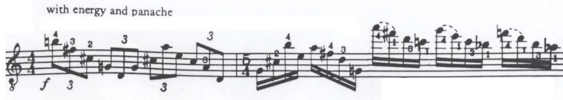
Example 20: Tippett, The Blue Guitar , “ Juggling ,” m. 51 and m. 52

Tippett uses large glissandi that cover almost the entire neck of the guitar (m. 54), which leads to the introduction of the golpe , a percussive strike on the body of the guitar.