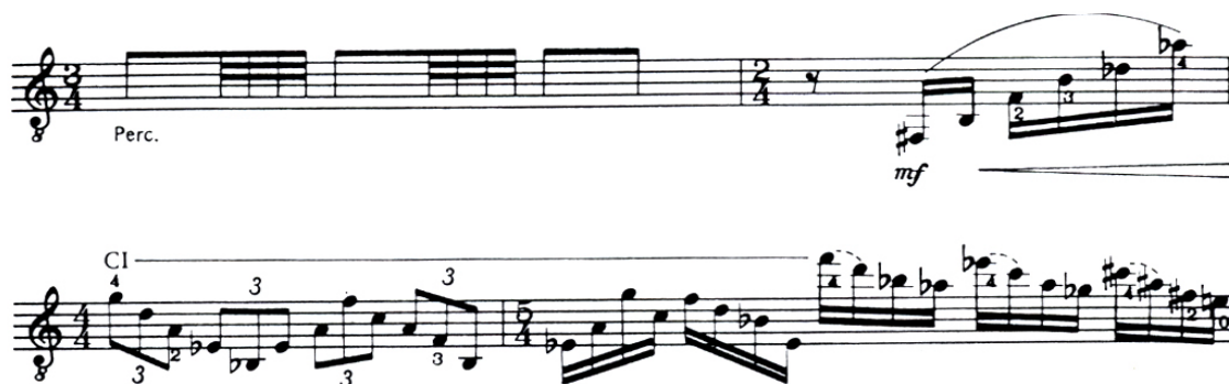
Example 21: Tippett, The Blue Guitar , “ Juggling ,” mm. 82-85

In mm. 62-72, the triplet figure that opened the second section is transposed a half-step lower to B-flat and later used in m. 77 (A-natural) and m. 84 (G-natural). There is a pull toward the end and now the percussive effects are interjected with rising and falling figures.