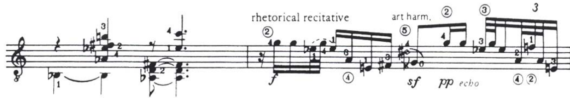
Example 24: Tippett, The Blue Guitar, “ Dreaming, ” m. 8 and m. 9

The D9 chord ending m. 8, serves as the dominant chord for the upcoming “ rhetorical recitative ” (mm. 9-12) in G.