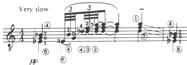
Example 23: Tippett, The Blue Guitar , “ Dreaming ,” m. 1 and m. 2

This movement is equally divided in two parts; mm. 1-32, characterized by four-measure phrases and mm. 33-64, predominantly in 3/4 meter as a contrast to the 2/4 meter of the first section. The movement opens in a “ Very slow ” tempo, with a four-measure phrase, repeated from mm. 5-8 with a harmonic change in m. 8. The opening arpeggio consists of two major neighbor chords played in succession, E-flat and D-flat, respectively. After the arpeggio, the D-flat chord is restated homophonically and connected to the opening E-flat chord by a descending glissando.