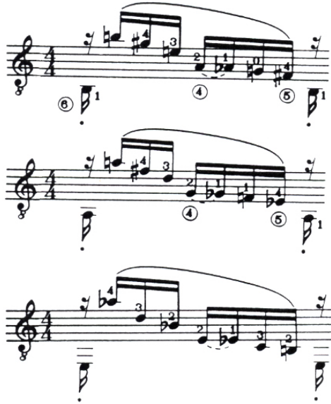
Example 22: Tippett, The Blue Guitar , “ Juggling ,” m. 87, m. 89 and m. 91