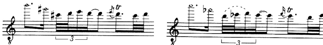
Example 1: Tippett, The Blue Guitar , “ Transforming ,” m. 5 and m. 13

The first movement can be broken down into two large sections: mm. 1-56 and mm. 57-146, with mm. 1-16 serving as an introduction. Although considered a sonata form, Tippett does not utilize the form in its traditional sense, but uses elements of the fantasia, creating an almost improvised feel. The sonata opens with an eight-bar phrase in a moderately slow tempo, which reaches a melodic climax in m. 5. This theme repeats from mm. 9-16, with the climax note of m. 5 raised one half-step higher in m. 13.