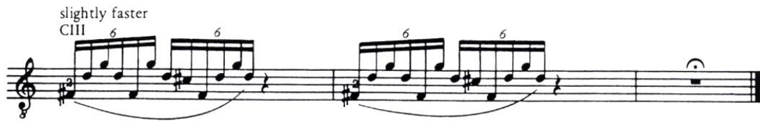
Example 26: Tippett, The Blue Guitar , “ Dreaming ,” mm. 62-64

Michael Tippett’s The Blue Guitar is the outcome of an idea, originated in Picasso’s painting and conveyed through Stevens’s words. The evolution of the ‘blue guitar’ subject through the eyes of these three different artists has resulted in major contributions in the fields of art, literature and music. It is my hope that this study will assist performing artists in further evolution of this subject, birthed almost a century ago.