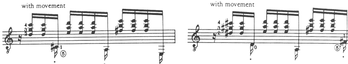
Example 11: Tippett, The Blue Guitar, “Transforming,” m. 77 and m. 81

Measures 77 and 81 consist of two layers: repeated tetra-chords in sixteenth note in the upper voice and an arpeggio in second inversion in the lower voice (D major and A major), which will be used as the thematic material for the two-voice canon beginning in m. 109.