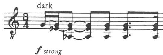
Example 13: Tippett, The Blue Guitar, “Transforming,” m. 17

Measure 85 brings to climax the conflict between “dark” and “light.” The “dark” chordal measures 17-22 are repeated. After each chordal measure, a “brilliant” three-measure passage is interposed.